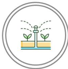
Smart Irrigation System