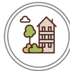
Commercial & Residential Maintenance